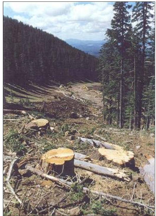
Save the Peaks Coalition

However, the Navajo Nation and a dozen other Southwest tribes filed suit to block the project, arguing that it would violate their religious freedom. The lawsuit also said the government did not adequately address the environmental effect of using wastewater, which would be pumped up a pipeline from Flagstaff.